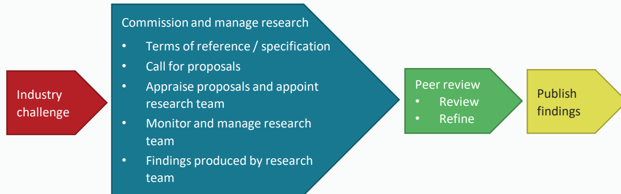
Fig 1. FIS Process map

Phase one will explore for each project: